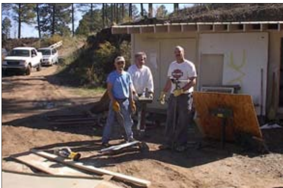
Some IPSC shooters working on clean-up day.