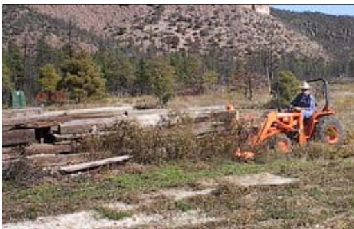
Little tractor at the shogun range.

Again, thanks to all the volunteers who came out for clean-up. LASC is an all volunteer organization, and LASC is only as good as the members make it. And we had 25 or so members that made it great on the 22 nd of October. Well Done!!