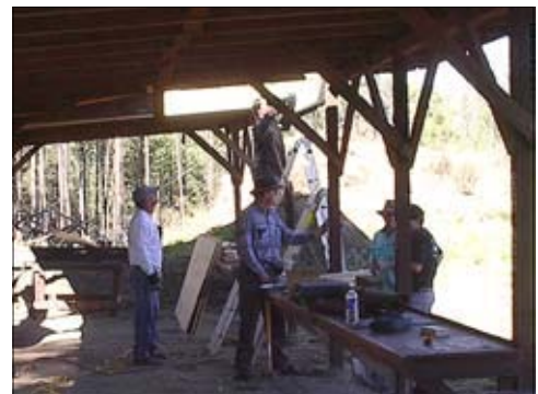
Yes, the roof at the pistols pits is repaired. Thanks guys!